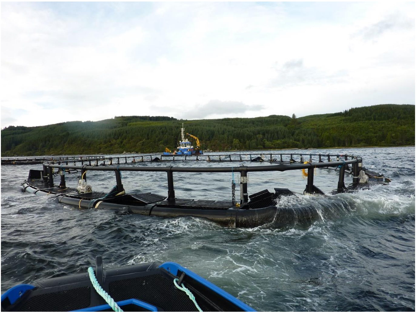
Figure 5: Cage 1 on the day of the physical inspection