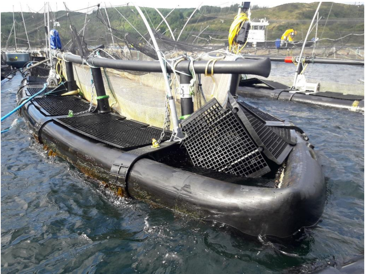
Figure 1: Cage 1 the day following the incident (21/08/2020)