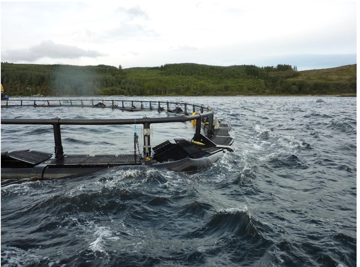
Figure 6: Cage 1 on the day of the physical inspection