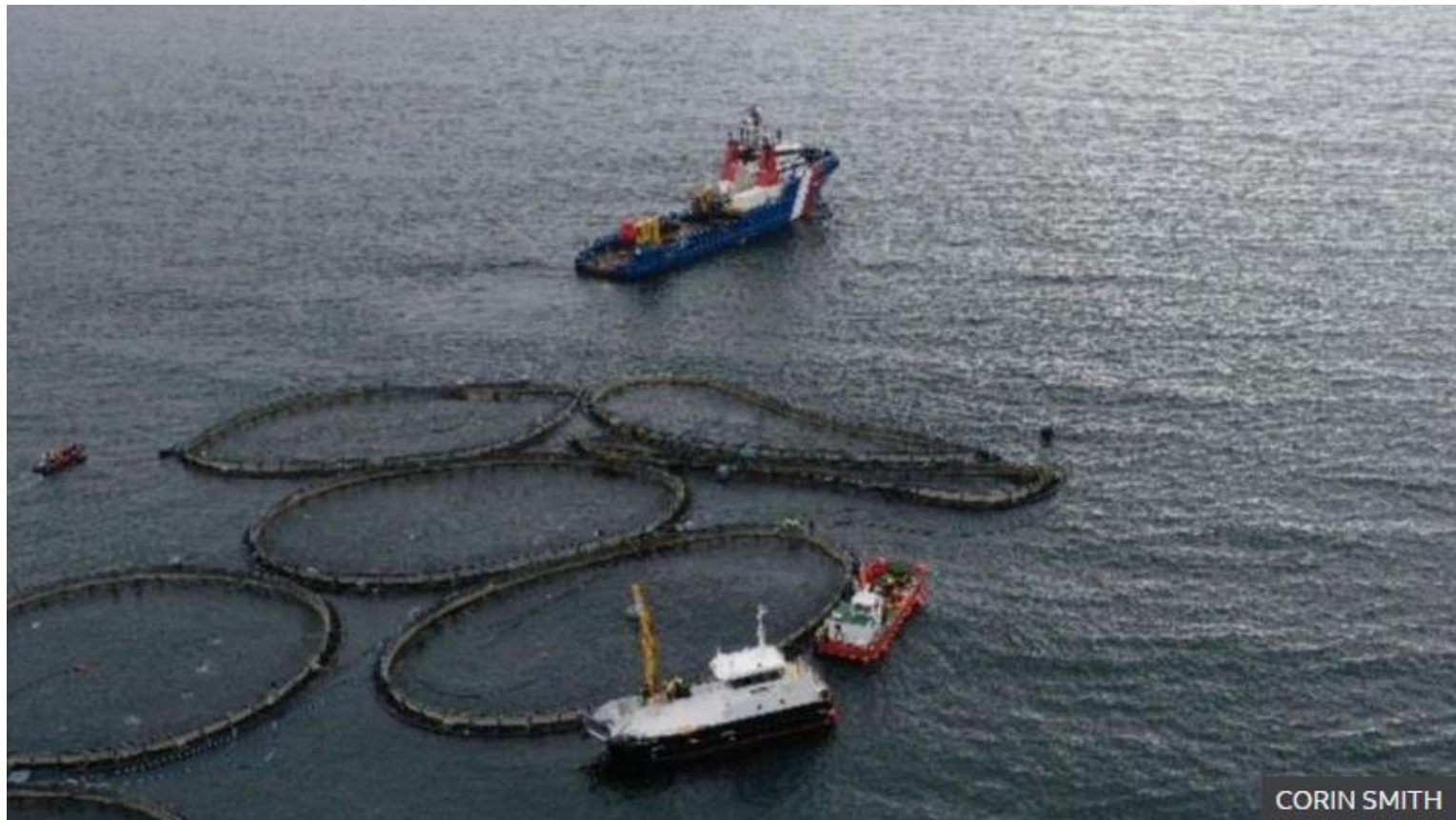
Figure 3: Drone photo of cages following the incident