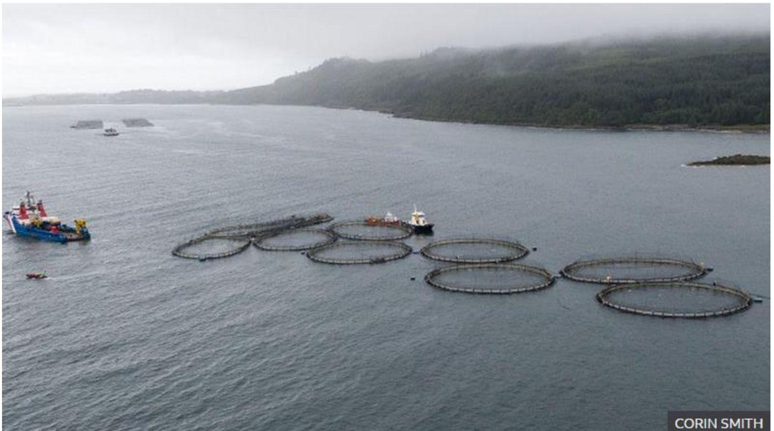
Figure 2: Drone photo of the cages following the incident