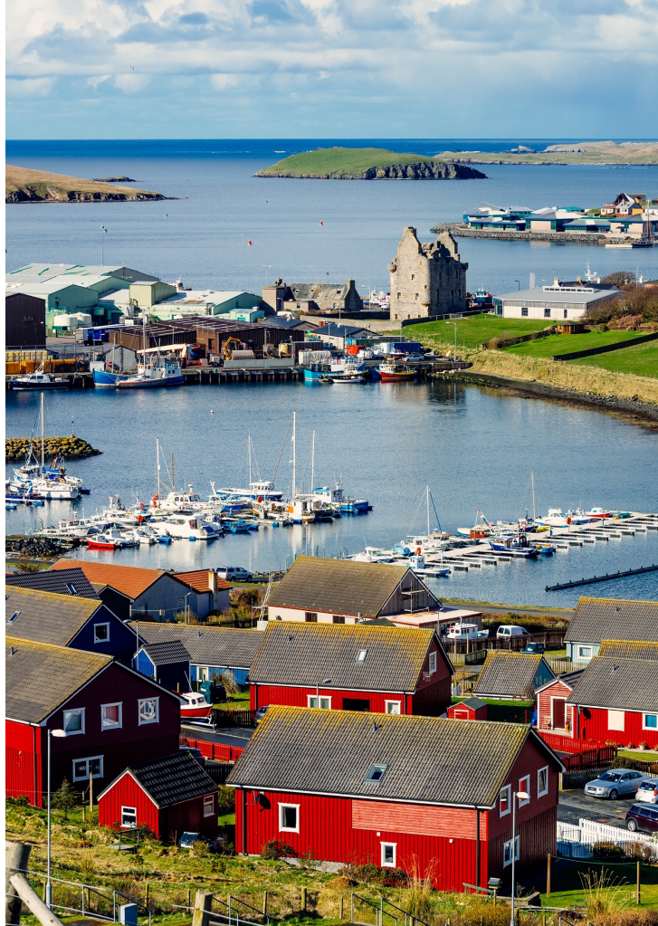
Scalloway, Mainland Shetland

71 islands which were previously inhabited, but which reported no permanent residents at the 2011 census. (See main report for list).