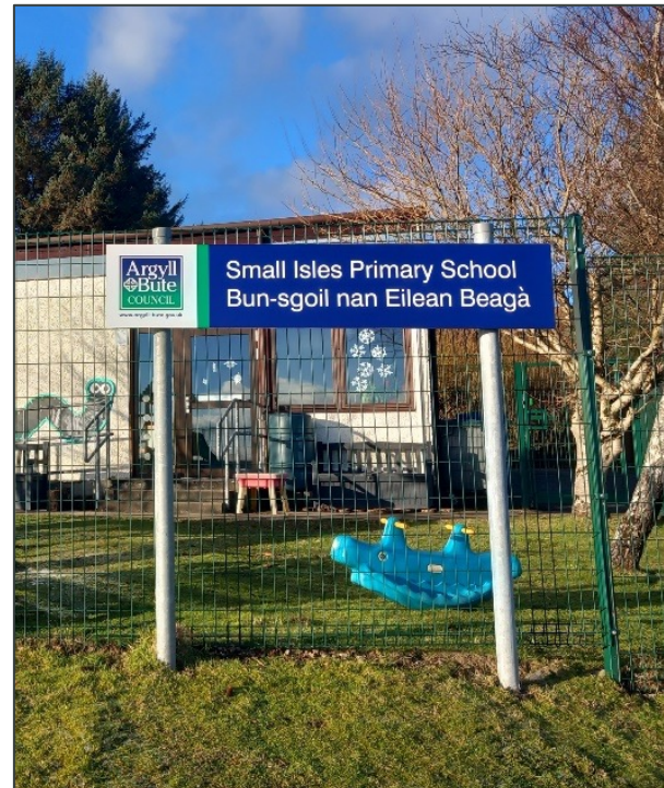
Small Isles Primary School, Jura

How an island connects to mainland Scotland via fixed links or ferries.