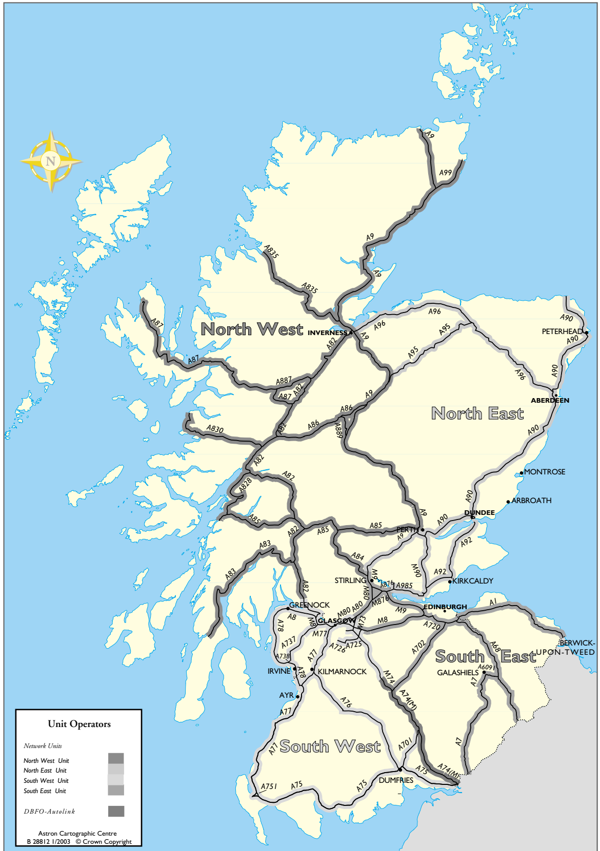
FIGURE 1: SCOTTISH TRUNK ROAD NETWORK