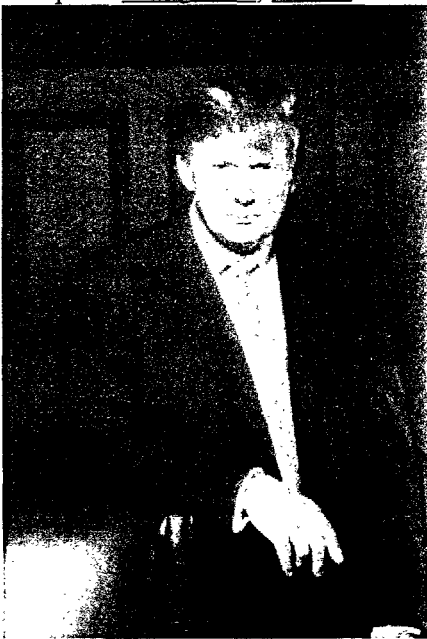
Donald Trump on NBC's The Apprentice

Donald John Trump, Sr. (born June 14, 1946 ) is an American business executive and founder and CEO of Trump Organization . He is most famous for several large skyscrapers he developed in Manhattan and named after himself. Starting with Trump Tower , he developed Trump World Tower along the East River , completed in 2001, and then began construction of the Trump Place Apartment complex along the Hudson River that same year. Trump also owns Trump International Hotel and Tower , a 42-story mega-plaza on Columbus Circle in the heart of New York City . Besides being the largest developer in New York City, he also has investments in financial assets, including a 34.6% stake in AdnanCo Group , an off-shore mortgage lender . In late 2003, Trump along with his siblings sold their father's real estate